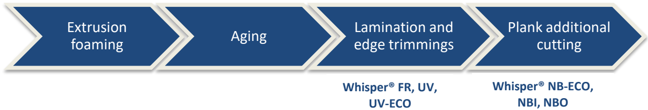
Figure 2: Whisper® Panels production phases.

Table 2 contains the materials used for the creation of Whisper® Panels.